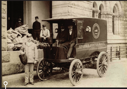
Electric automobile, 1901