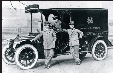
Parcel Post truck, 1913