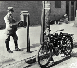
Motorcycle, circa 1911