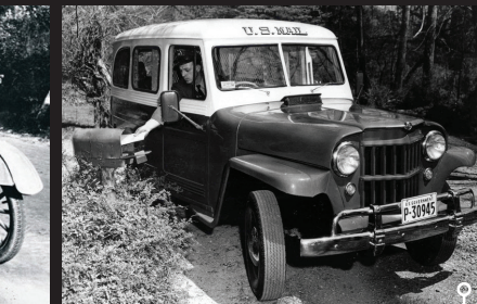
Jeep, circa 1950