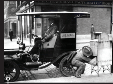
Columbia automobile, 1906

wagons were used from the late 1880s until they were gradually replaced by motor vehicles.