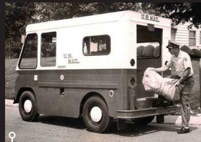
Zip Van, circa 1964

to maneuver in snow or wind, prone to tipping and offered little protection in crashes. They became known as “Westcoasters” because they worked well only in areas with consistently fair weather. The number of mailsters in use peaked in 1966, at about 17,700. By the early 1970s, they largely were replaced by the Jeeps that many rural carriers already used.