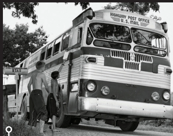
Highway Post Office, 1953