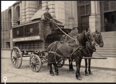
Regulation wagon, circa 1895