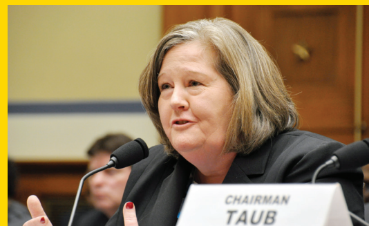
Postmaster General Megan Brennan testified before the House Oversight committee in February on the vehicle procurement process.

Brennan said that when testing begins, it is expected to go on for 12 to 18 months. “We like to test those vehicles in different climates and different topography and the like,” she said. USPS will