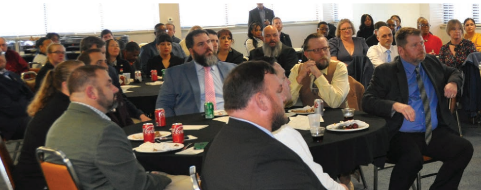
The graduation luncheon was held on Dec. 8 at the Maritime Center in Linthicum Heights, MD.

The 31 participants (listed below) now add their names to an ever-lengthening list of graduates of the Academy. During their classes,