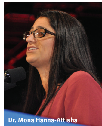
Dr. Mona Hanna-Attisha