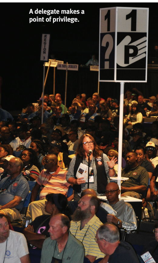
A delegate makes a point of privilege.

The one that was approved, General Resolution 3, called for NALC members to participate in legislative and grass-roots efforts with postal allies to oppose Trump administration policies. Letter carriers are encouraged to download the NALC Member App, contribute to the Letter Carrier Political Fund, and to perform get-out-the-vote actions such as phone and text banking and canvassing.